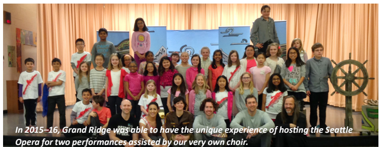
In 2015–16, Grand Ridge was able to have the unique experience of hosting the Seattle Opera for two performances assisted by our very own choir.