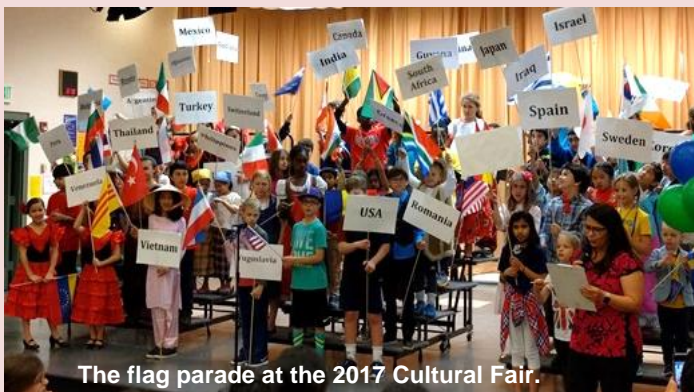
The flag parade at the 2017 Cultural Fair.